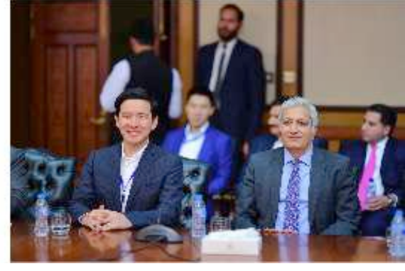
Introducing blockchain technology to Pakistan, discussing with Imran Khan, the prime minister of Pakistan, Arif Alvi, the President of the Islamic Republic of Pakistan and Khalid Maqbool Siddiqui, the Federal Minister for Information Technology of Pakistan.