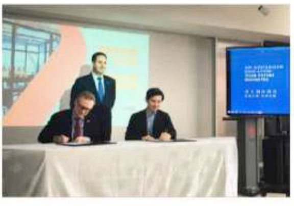
Witness by the Minister of Trade & Investment of Austrade Steven Ciobo, Blockchain Centre is Signing MOU with Australian Trade and Investment Commission (Austrade).