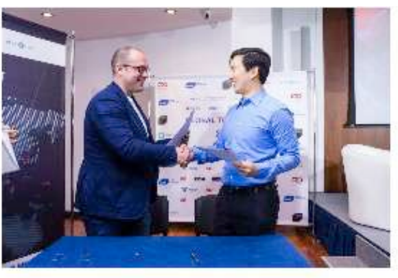
Signing agreement with Russian government-owned bank Vnesgeconombank (Bank of Foreign Economic Activity).