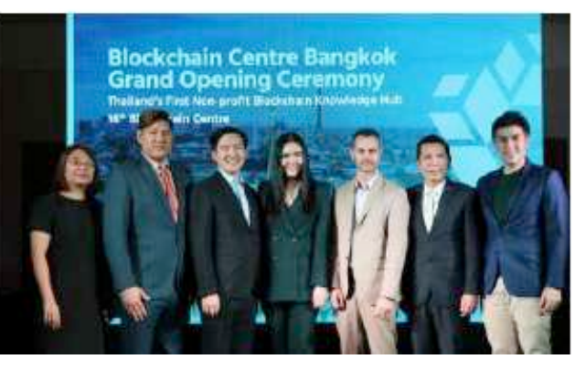
Blockchain Centre Bangkok was inaugurated by officials from Thai Fintech Association, International Affair Bureau the NBTC, Australian Trade Commission the Australian Embassy in Thailand.