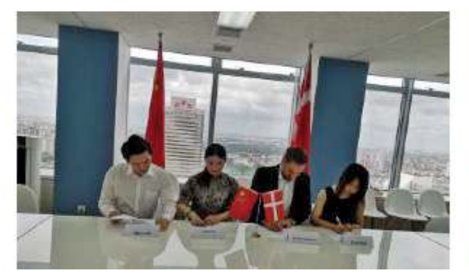
Signing MOU with Danish Consulate, Blockchain Centre will support Danish consulate for its two years Blockchain Business Bridge project, connecting Shanghai and Copenhagen tightly in the future blockchain industry.