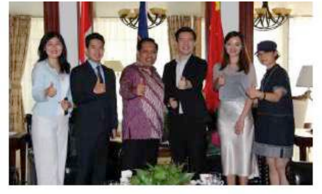
Visiting Mr. Djauhari Oratmangun, the Ambassador of Indonesia and Mr. Enggartiasto Lukita, the Minister of Trade, discussing the possibility of bringing Blockchain Centre to Indonesia.